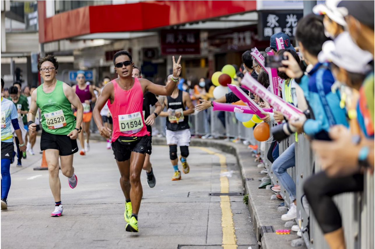
Citizens cheer on the runners of the Standard Chartered Hong Kong Marathon 2021 along the race routes.