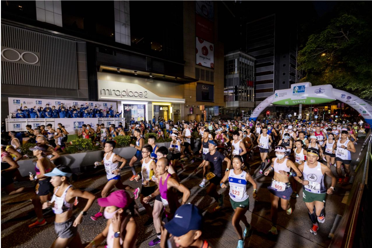
Runners of the Standard Chartered Hong Kong Marathon 2021's Marathon Challenge race spring into action, determined to finish the 42.195km race.